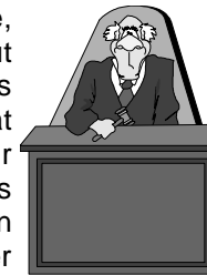
From the Chair

the local planning processes, we made written representations and by the time you are reading this will have met with the Committee. Interestingly enough we have been told that any references to the LDF process is outside their brief!!!